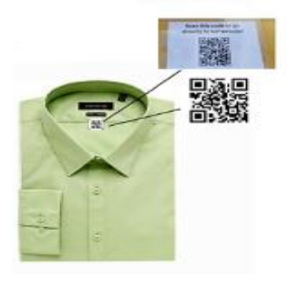
Figure 1. Basic positioning of QR code in cloth [8]

A laminated QR-code is impervious to water and dust, pressure is implanted inside the clothes. The QR-code has a special ID written in it by manufacturer. The manufacturer will create a new entry for the Id, fill his side of the table information. The retailer, after selling the product will fill a couple of extra points of interest. In the user side, the QR-code will be scanned by the Mobile Application, then the Id will be read by it. It is cross referenced with the database after that, corresponding details are retrieved.