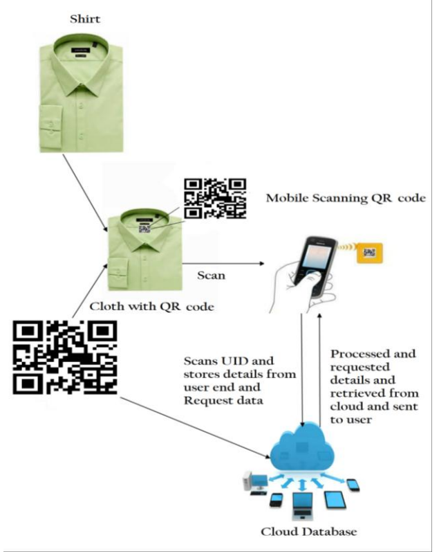
Figure 2. Basic working of the system [8]