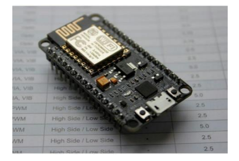
Fig no.2: WiFi Module

ESP8266 WiFi Module is a self-contained SOC with integrated TCP/IP protocol stack that can give any microcontroller access to your WiFi network. The ESP8266 is capable of either hosting an application or offloading all Wi-Fi networking functions from another application processor. Each ESP8266 module comes preprogrammed with an AT command set firmware, meaning, you can simply hook this up to your Arduino device and get about as much WiFi ability as a WiFi Shield offers (and that just out of the box) The ESP8266 module is an extremely cost-effective board with a huge, and ever-growing, community. This module has a powerful enough on-board processing and storage capability that allows it to be integrated with the sensors and other application-specific devices through its GPIOs with minimal development up-front and minimal loading during run time. Its high degree of on-chip integration allows for minimal external circuitry, including the frontend module, which is designed to occupy minimal PCB area. The ESP8266 supports APSD for VoIP applications and Bluetooth co-existence interfaces, it contains a selfcalibrated RF allowing it to work under all operating conditions and requires no external RF parts.