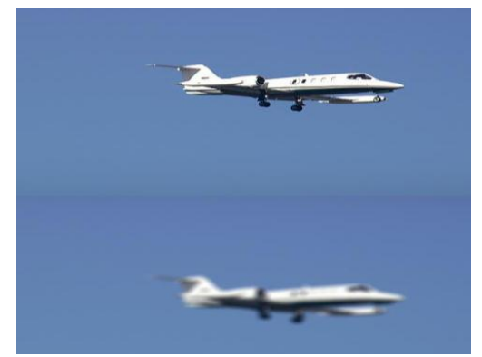
Figure 1. Image 1