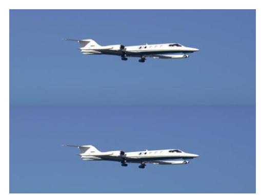
Figure 3.Merged Image using figure 1 and 2.