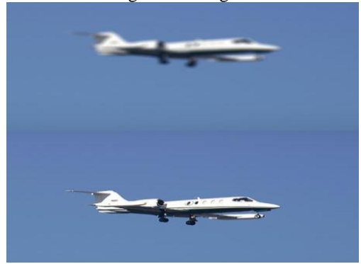
Figure 2. Image 2